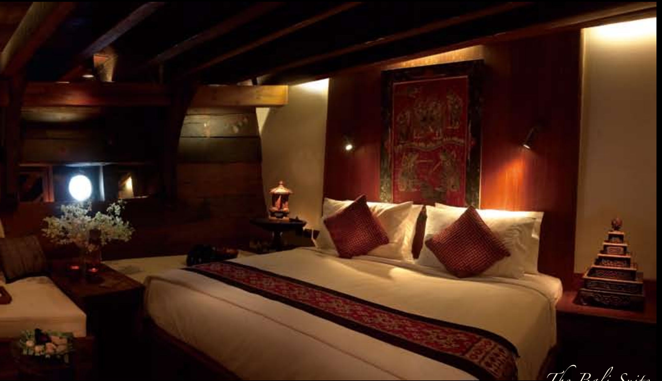
The Bali Suite